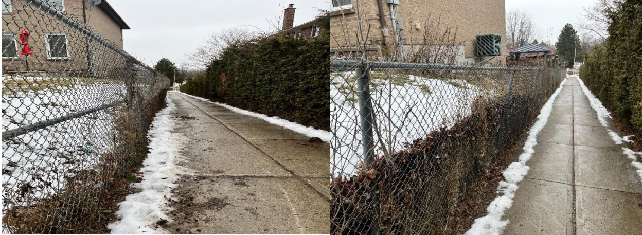
Figure 4 – images of the challenges in plowing this walkway due to a streetlight being installed in the middle of this walkway at both ends: