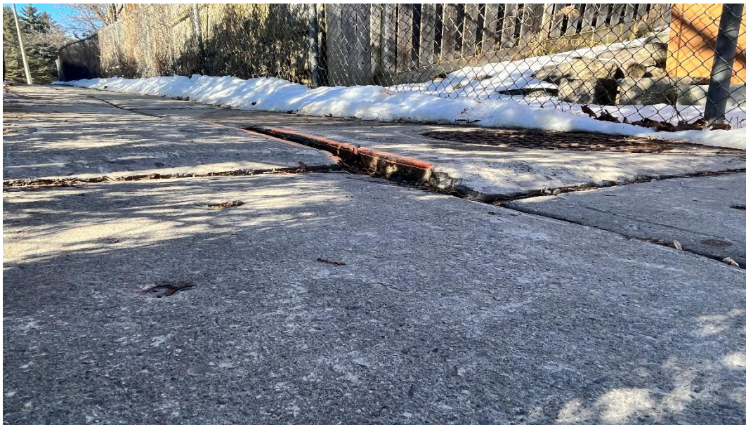
Figure 5 – Sidewalk panels heaved:

Other documented deficiencies include cracked panels, heaved sidewalk bays, separations creating large gaps pose a trip hazard to walkway users.