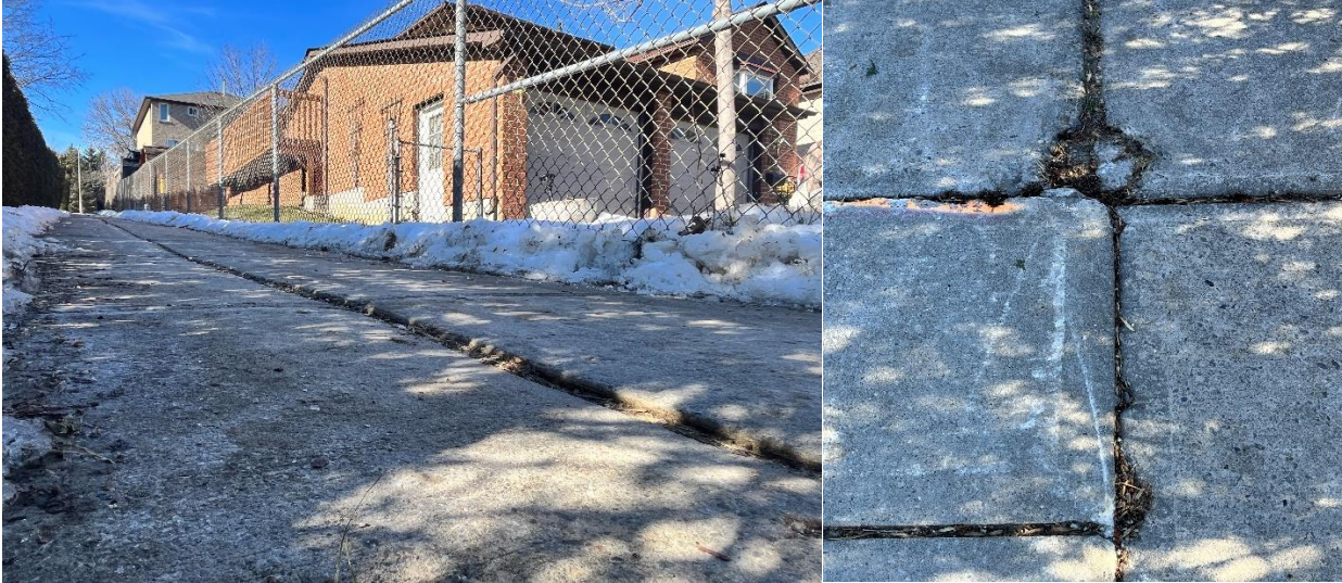
Figure 6 – Longitudinal joint deflections and uneven walking surface: