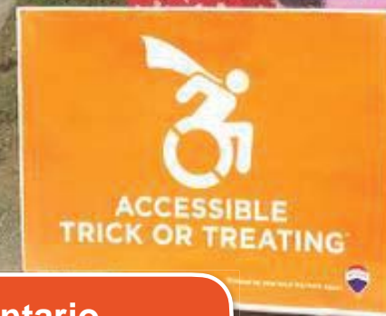
The Padulo Family Treat Accessibly Founders