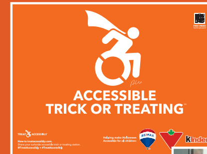
Lawn Sign comes fully assembled