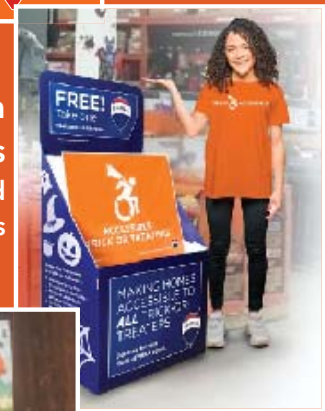
Lawn Sign Take One Kits comes fully assembled with 50 Lawn Signs