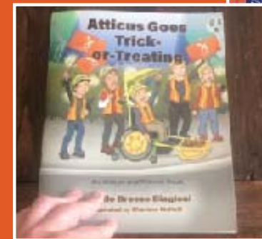
Children's Book authoured by the Grandmother of a little boy with disabilities.