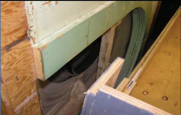
Ticket window from Aurora railway station, 1900. (Removed during renovations by GO Transit.)