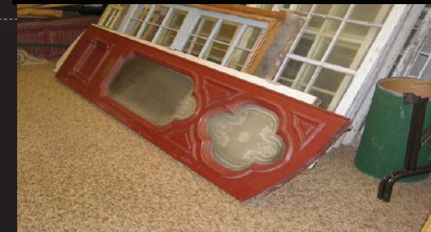
Front doors from Inglehurst (the Fleury House), formerly used in entrance to main gallery of Aurora Museum, window sash and surround with restored painted graining from Gairlands , window sash from Trinity Anglican rectory.