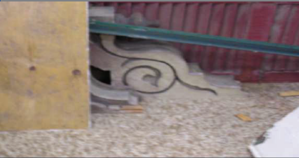
Decorative roof bracket from Railroad Hotel (Wellington and Berczy streets). Collection also includes banister and spindles and decorative ironwork from the hotel.

Report to H.A.C. offering glimpses of salvage