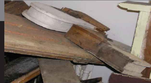
Decorative brackets from Doan Hall, mantelpiece and floorboards from Gairlands (Hartman House), part of stairway from Simpson house.