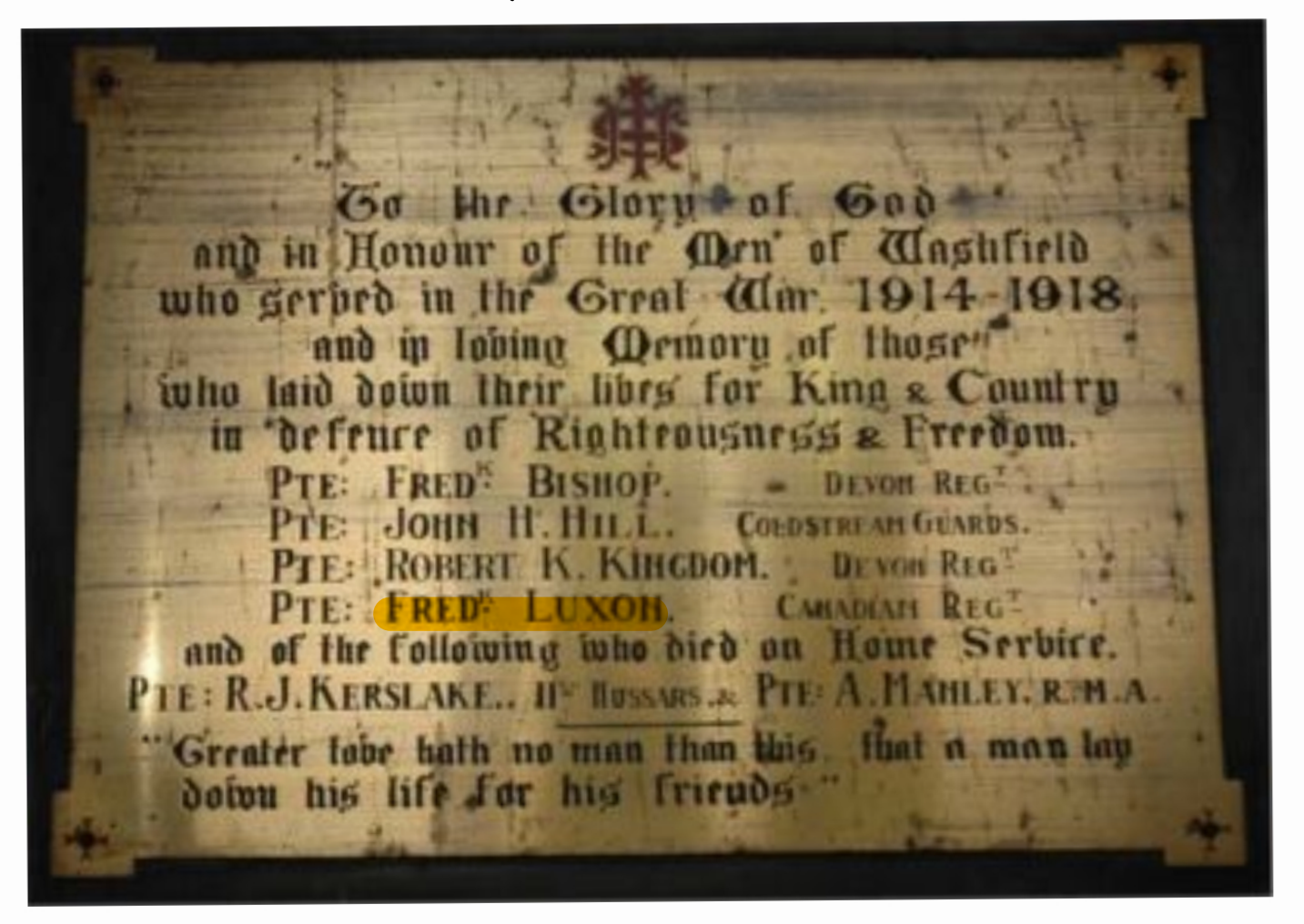
War Memorial Shelter, Washfield