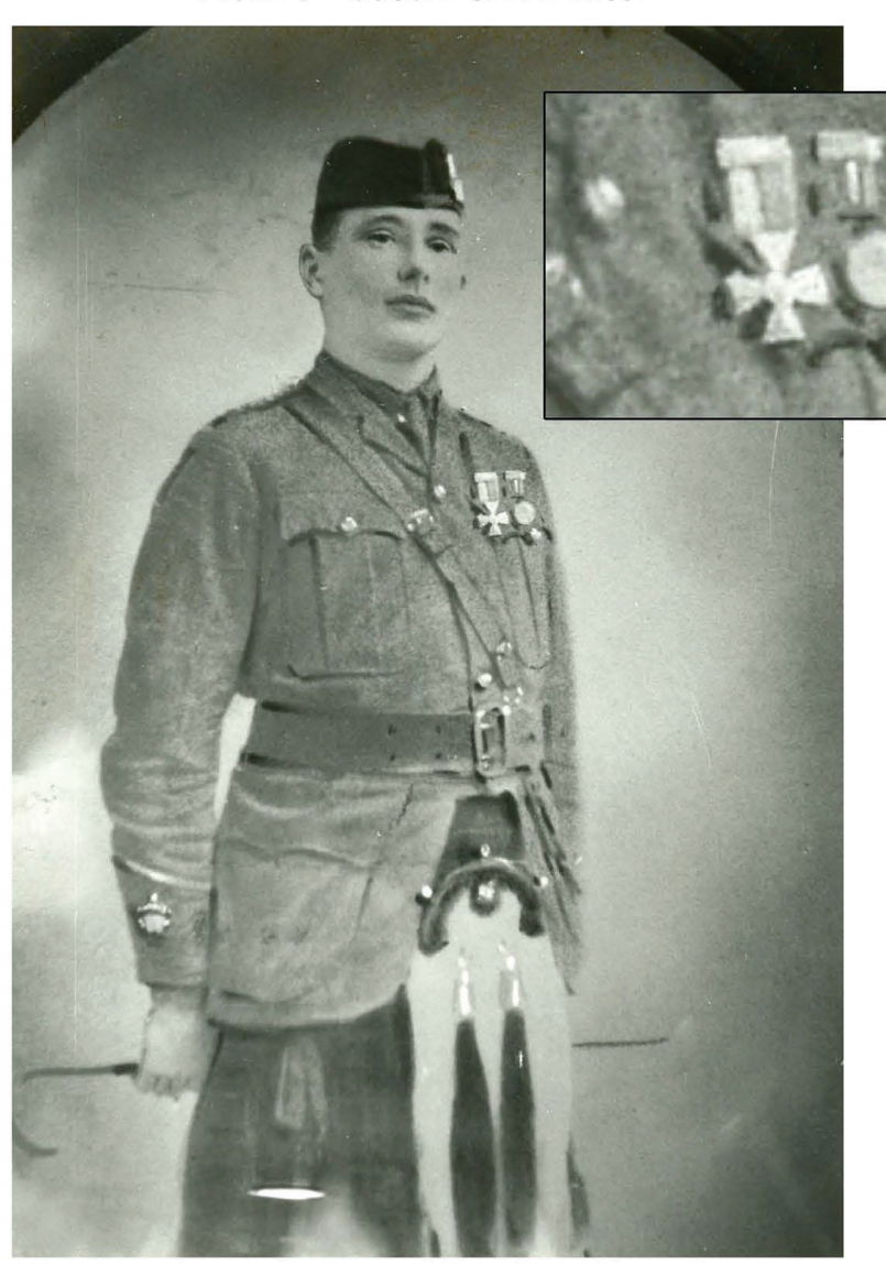
Military Cross, c.1916 Canadian War Museum