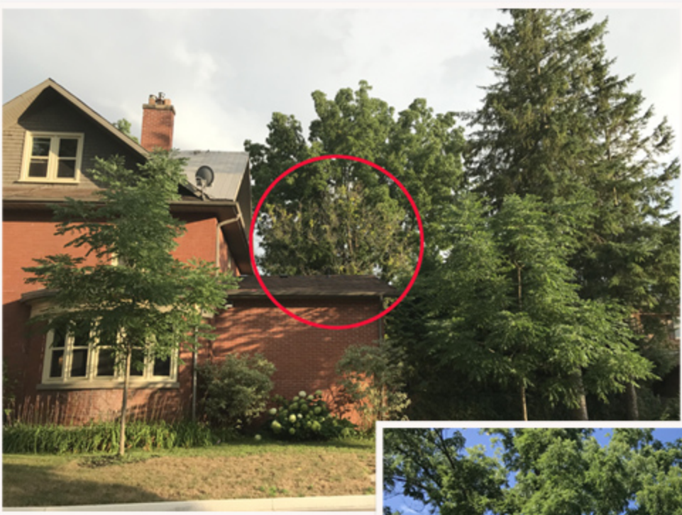
Existing Locust to be removed