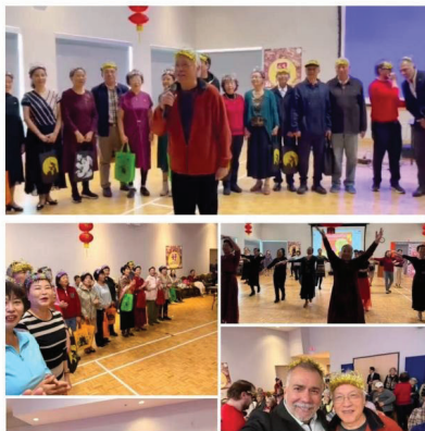
Mid-Autum Festival and Birthday party