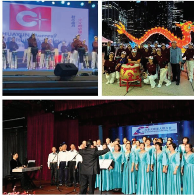
Drum permormace , 6th Dragon Festival Toronto , 08 29 and 31 2025 Choir performance 24th international Senirs Festival ,10 12 , 2025