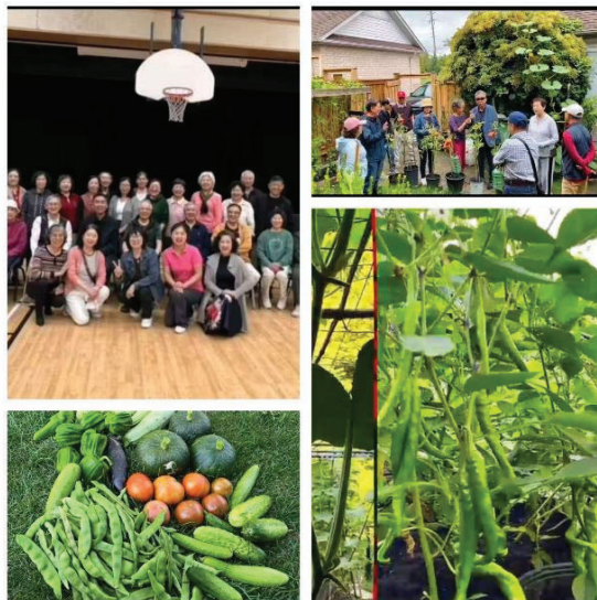
My back yard garden program 2025