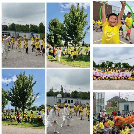
Kids Taichi summer canp with Elamb Acadamy