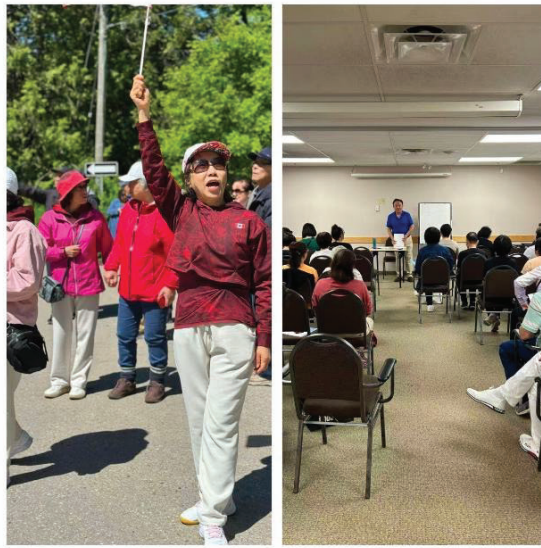
Day trip to Elora On /weekly English studay