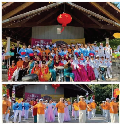
Line Dacing show with other 4 senior teams from Newmarket, Markham, Richmond Hill at Town park Aurora ,09 17 2025