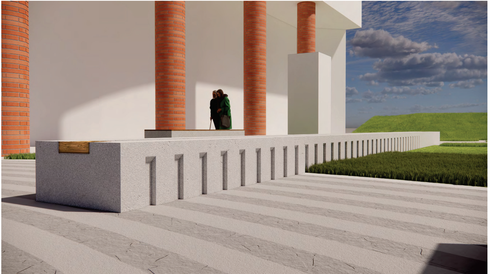
Image of "Sky Ribbon" Plinth depicting simple formwork impression that fades as it grows further from the Gathering Place. Note: Vegetation removed to show relationship to adjacent spaces.