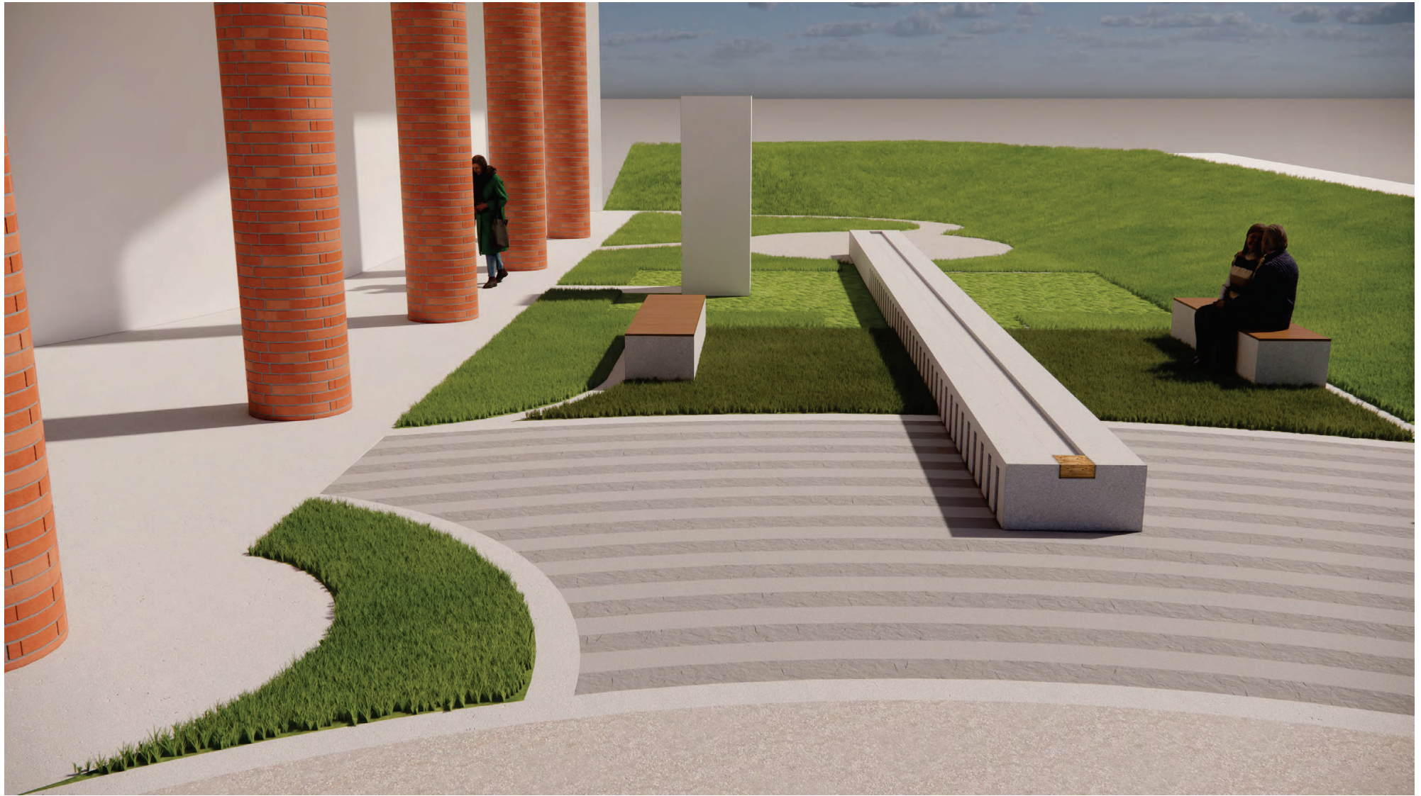
Contemplation Space with vegetation removed to show hardscape elements and spatial relationship of distinct areas.