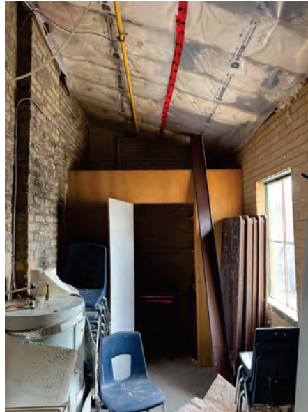
Ancillary space showing alterations, and exposed utilities (current south elevation addition)