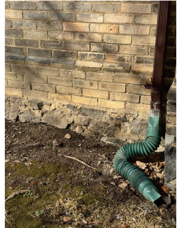
Condition of lower buff brick wall and downspout area