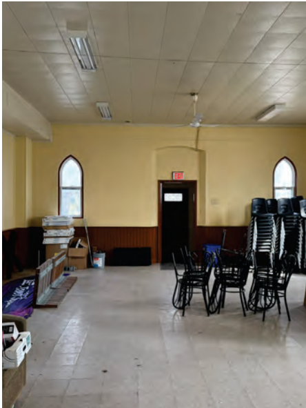
Main hall showing window openings, side trim, and wood wainscoting