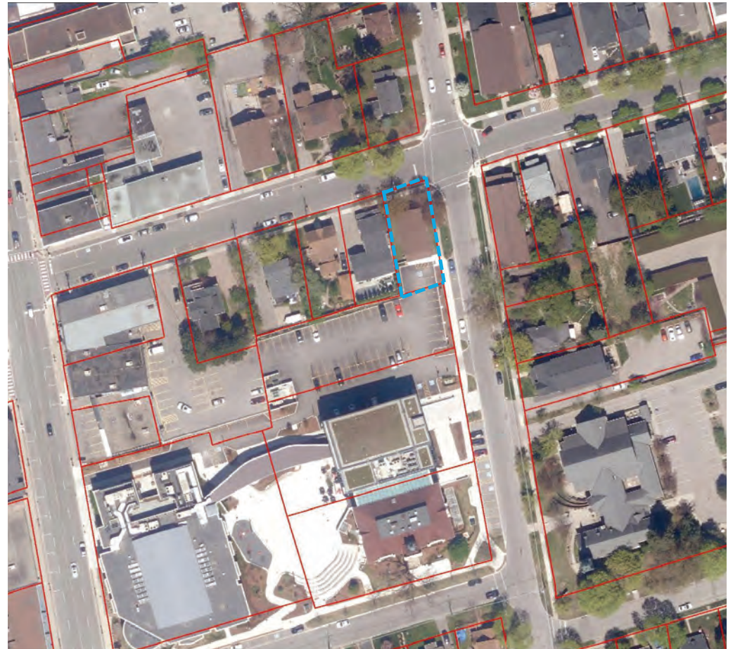
Aerial view showing the subject property within the context in dashed lines