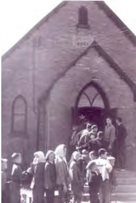
1950s, Aurora Library