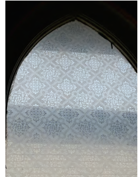
Close-up of pointed window opening