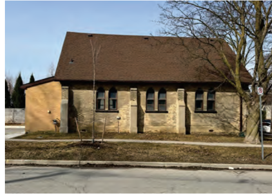
East elevation facing Victoria Street