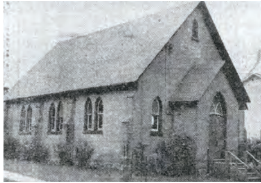
1951, northeast corner of the building serving as a public library