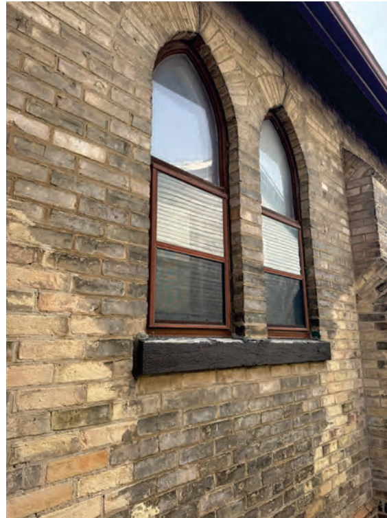
Masonry cracking at the pointed window arch