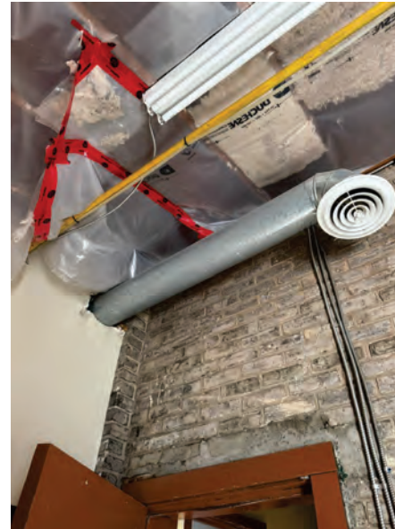
Exposed services, and insulated ceiling assembly against historic brick