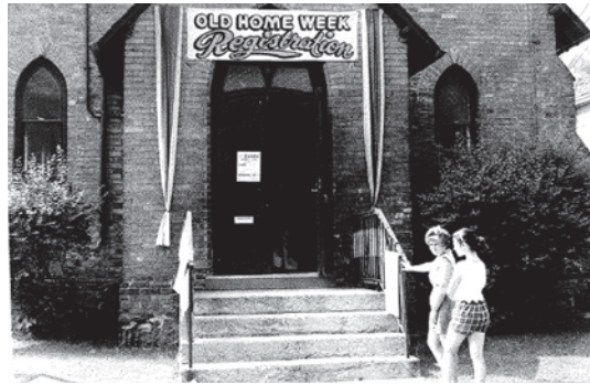
1963, Old Home Week Headquarters