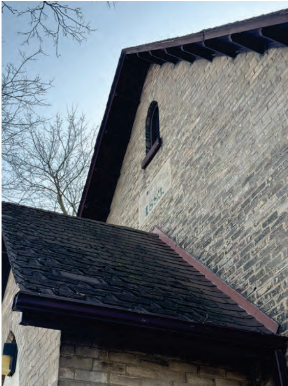
General view of gable end and roofline