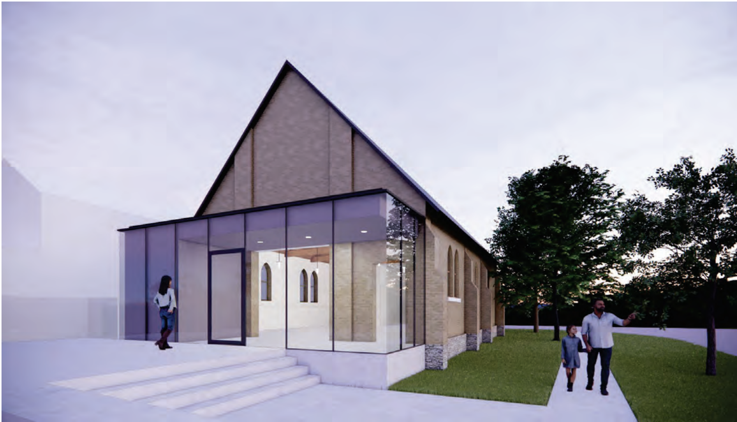
Rendering illustrating the proposed south elevation addition, proposed stairs and ramp