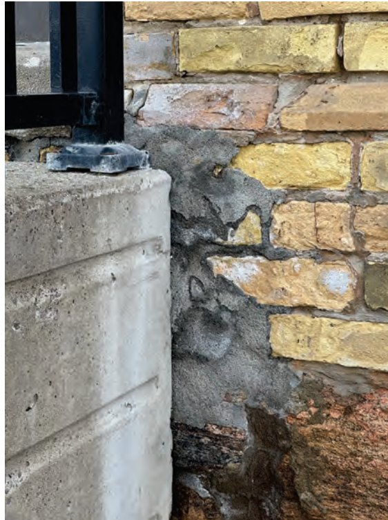
Cementitious repair and deterioration at junction with brick masonry