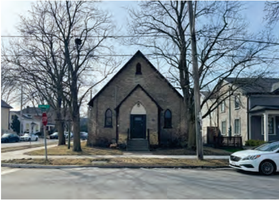
North (principal) elevation facing Mosley Street