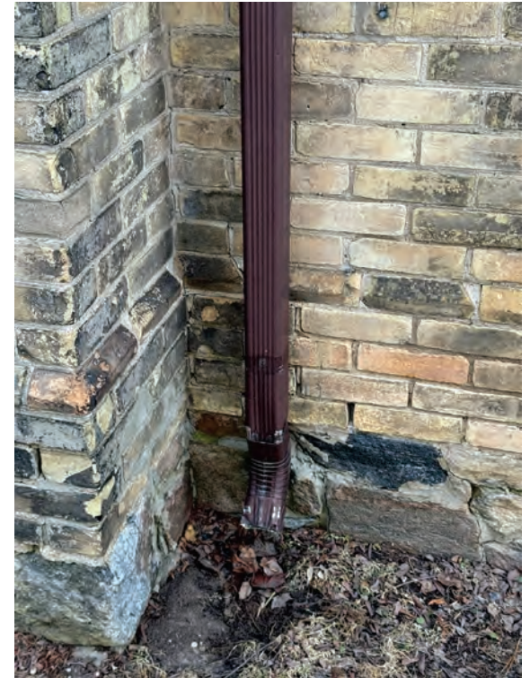
Downspout discharge at foundation with localized masonry deterioration