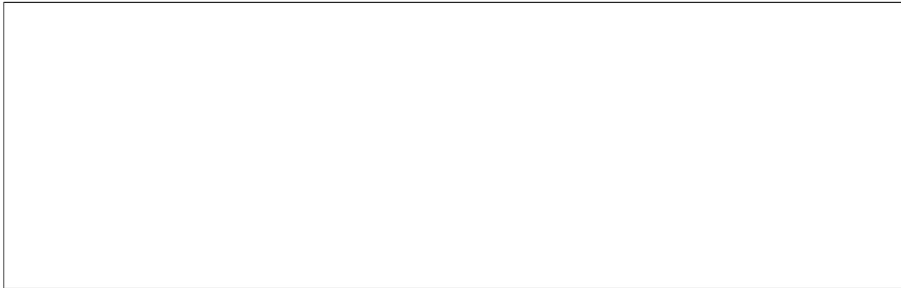
3 NOT USED SCALE: NTS