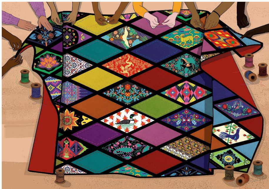
Community Builds Community Mural Design Revised

The Artists recently submitted the revised version of the mural design. As shown below, it features various quilt patterns that are loosely based on the numerous non-official language groups (i.e., non English or French) represented in Aurora according to 2016 Census data. The Artists conducted research and consulted people in their network when selecting the quilt patterns represented in the design, however, the quilt is not intended to be an exact visual representation of each language group or ethnicity identified in Aurora's census data. Additionally, based on consultation, the Artists also included a quilt pattern with a loon and stylized maple leaves that reflects the Canadian identity as a whole.